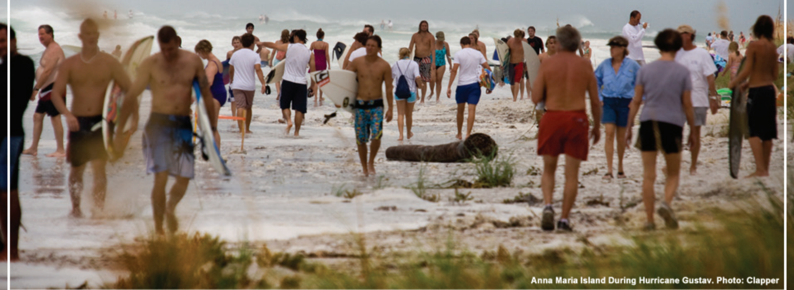
Anna Maria Island During Hurricane Gustav.

Gulfster averages over 25,000 unique users per month. The average time spent on the site is over two minutes 10 seconds, and over 65% of our viewers have either bookmarked or made gulfster.com their homepage.